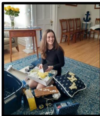
Bid Day Spring 2023!