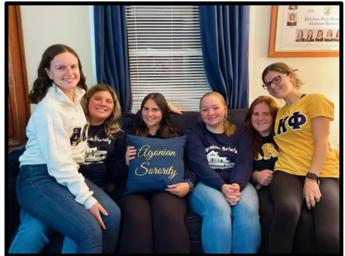
Fall Initiation '22