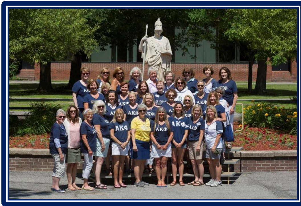
Ago Summer Reunion 2019