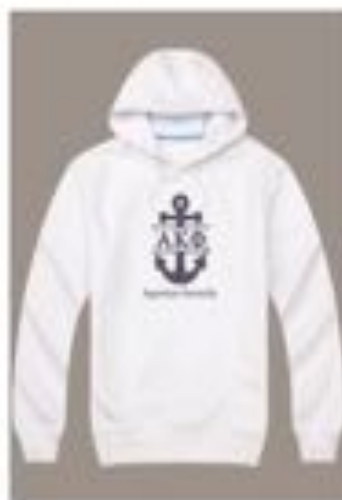
Adult unisex White Hoody (50/50) Screen printed $30.00

Mail completed order form with check payable to Agonian Sorority: