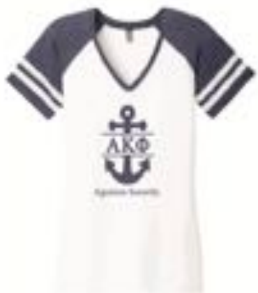
Adult unisex V-neck White T (50/50) Screen printed $20.00